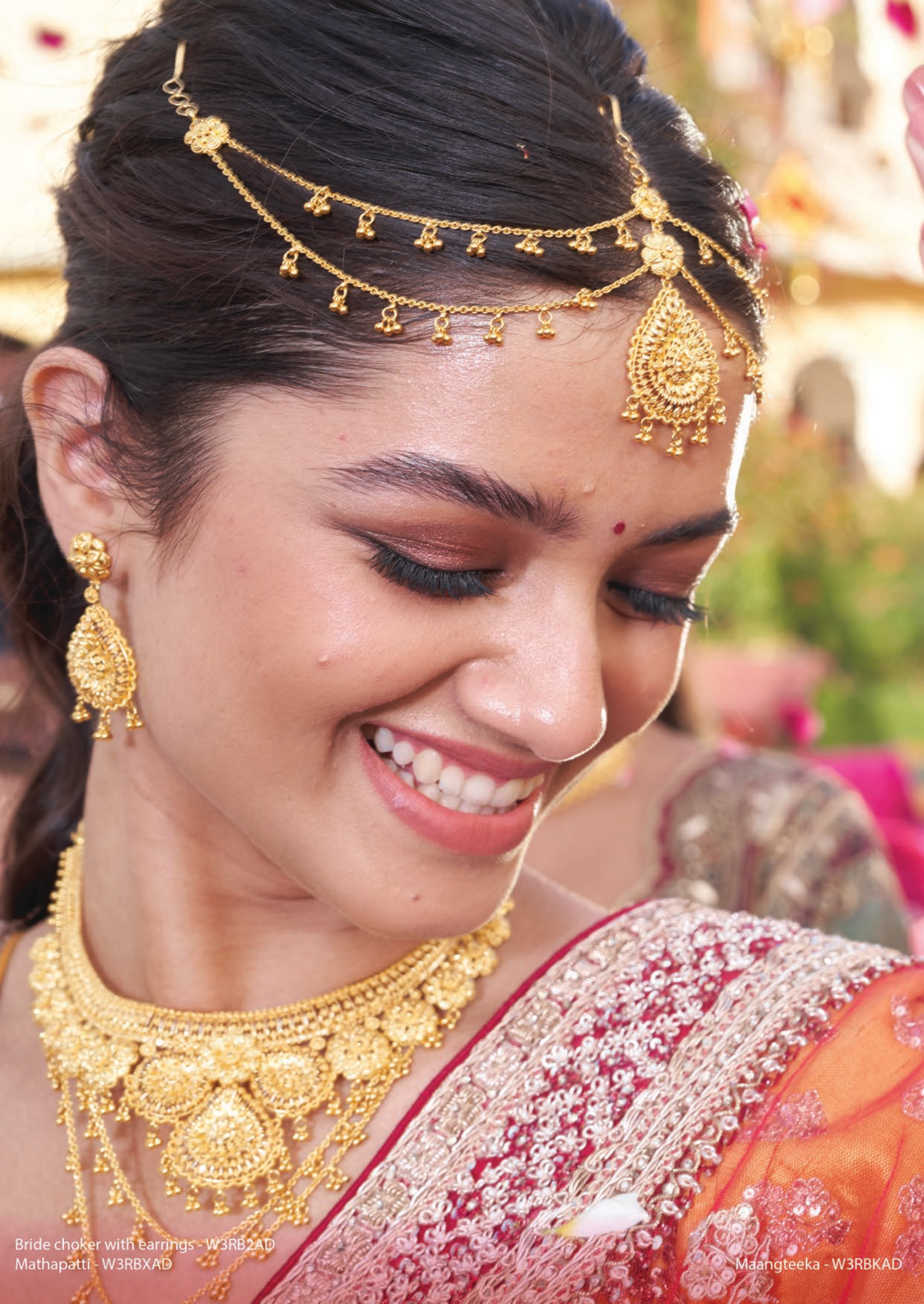
Bride choker with earrings - W3RB2AD Mathapatti - W3RBXAD