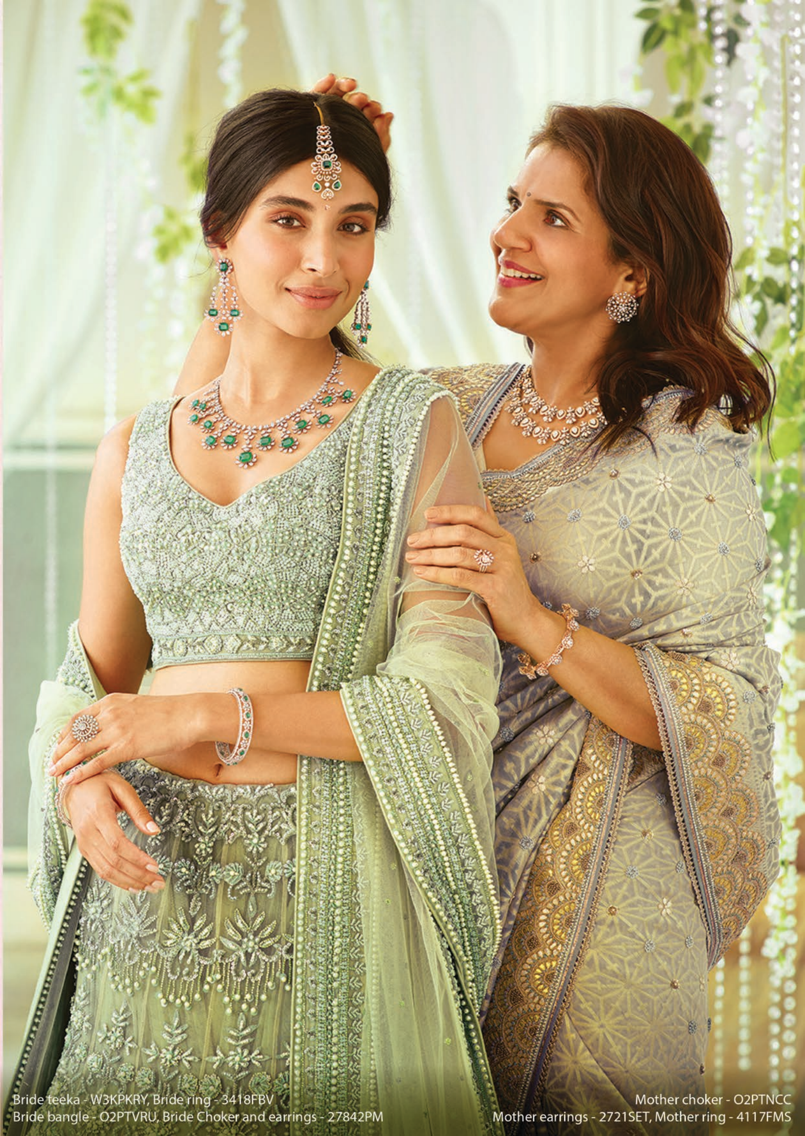
Bride teeka - W3KPKRY, Bride ring - 3418FBV Bride bangle - O2PTVRU, Bride Choker and earrings - 27842PM