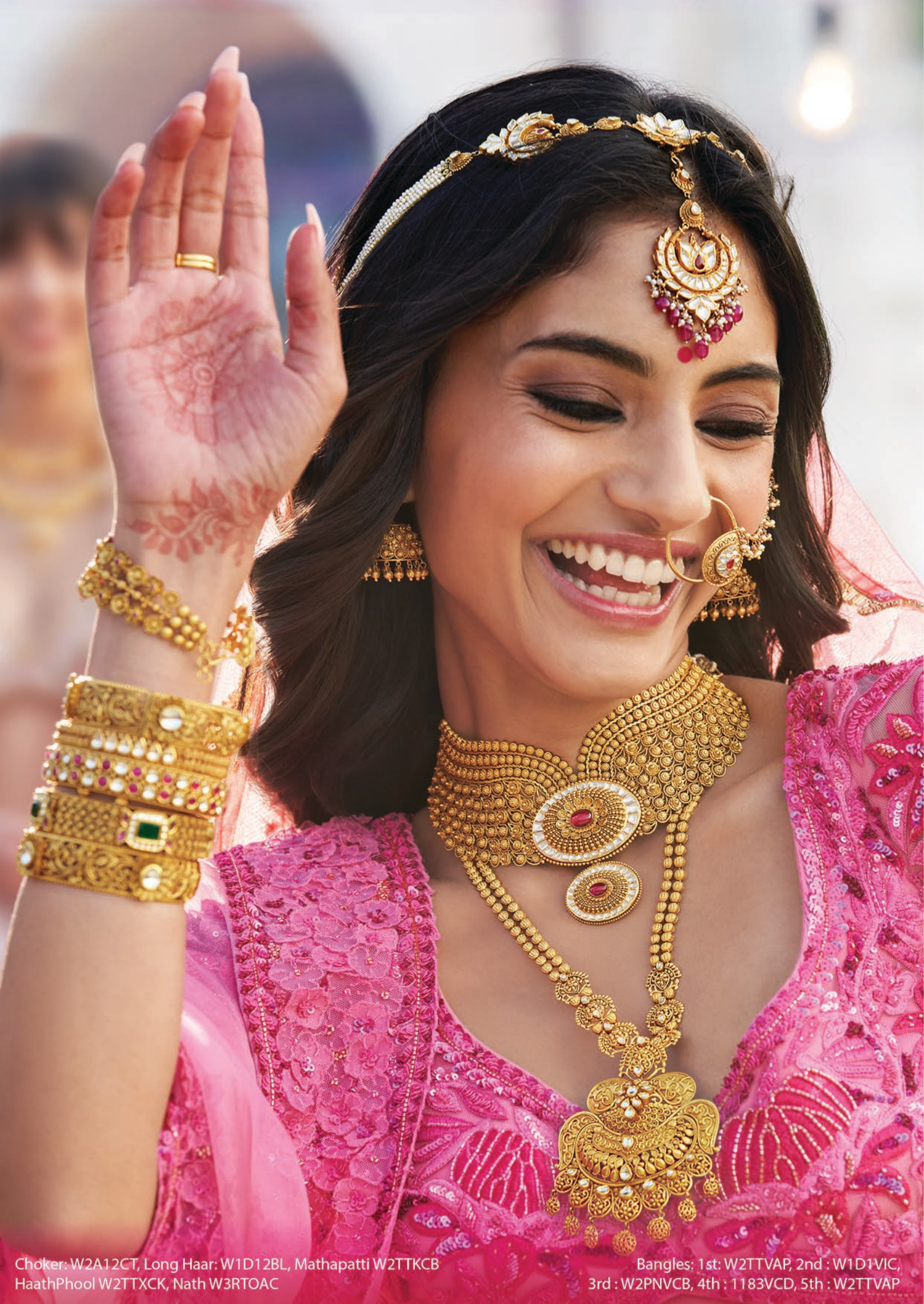
Choker: W2A12CT, Long Haar: W1D12BL, Mathapatti W2TTKCB HaathPhool W2TTXCK, Nath W3RTOAC