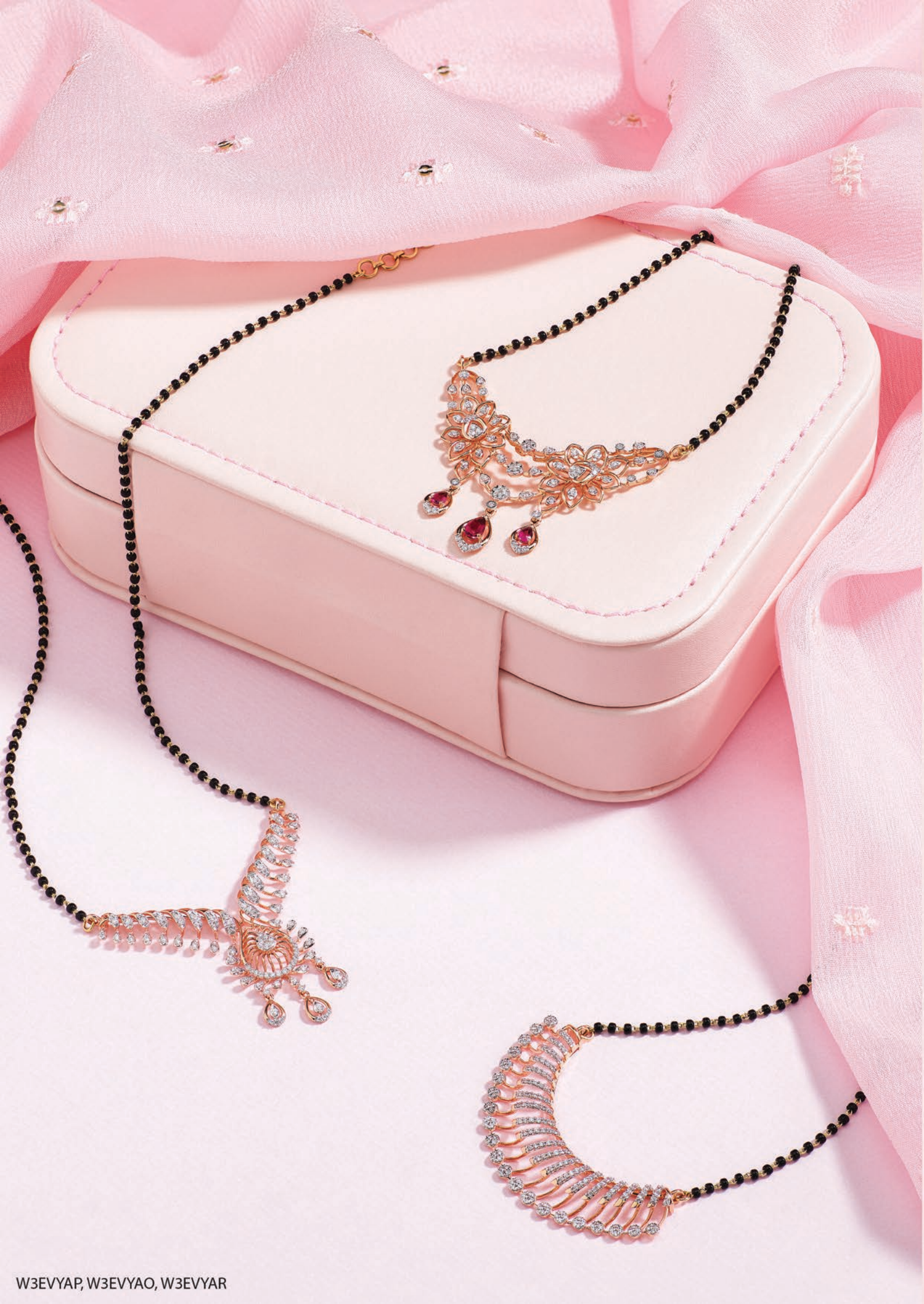
W3EVYAP, W3EVYAO, W3EVYAR