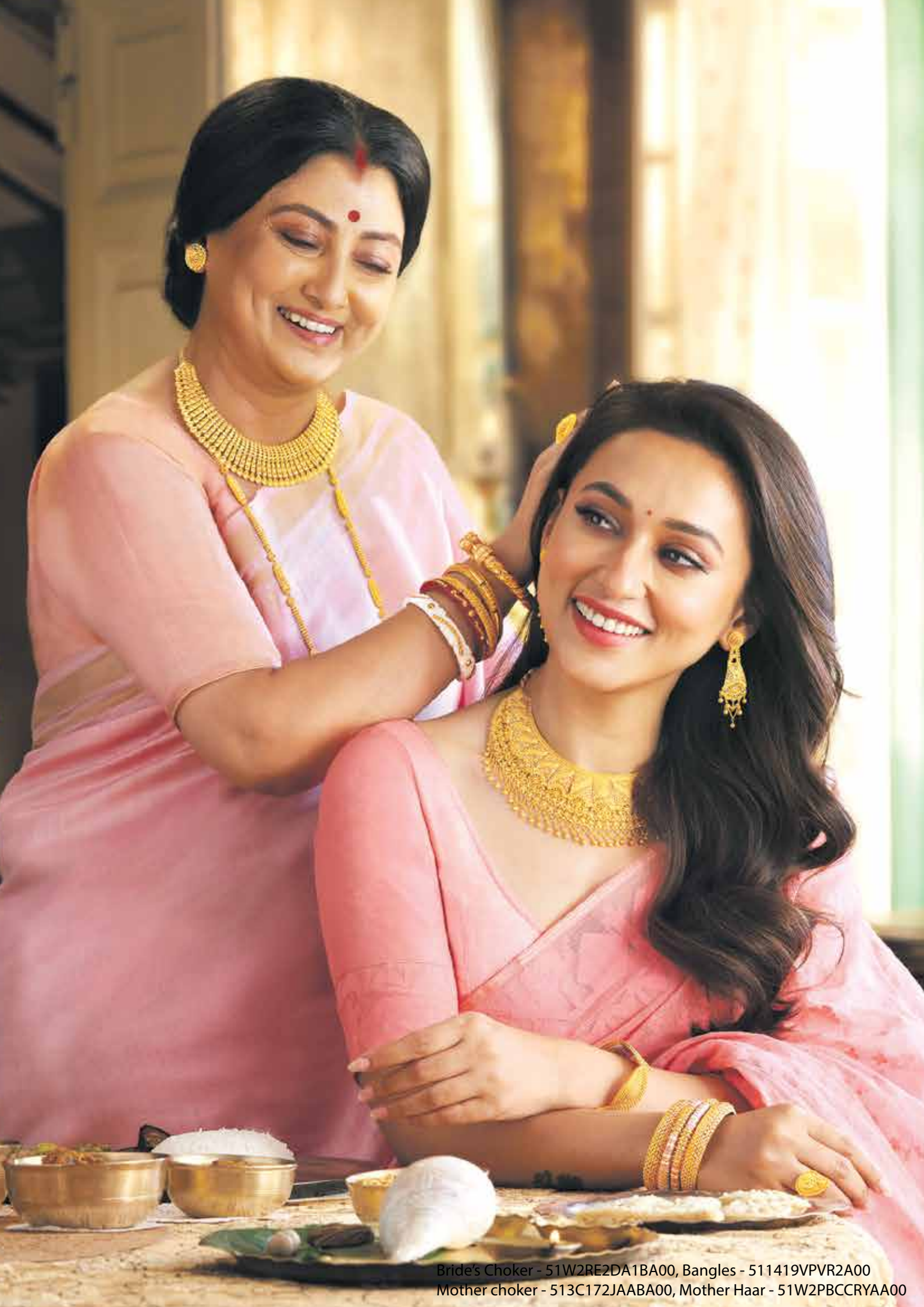
Bride's Choker - 51W2RE2DA1BA00, Bangles - 511419VPVR2A00 Mother choker - 513C172JAABA00, Mother Haar - 51W2PBCCRYAA00