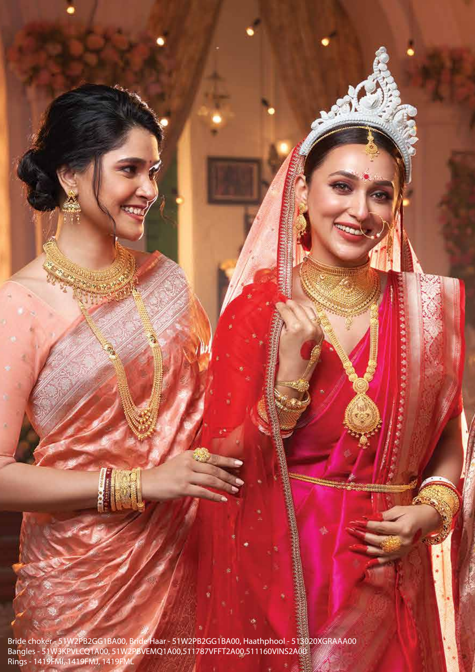
Bride choker - 51W2PB2GG1BA00, Bride Haar - 51W2PB2GG1BA00, Haathphool - 513020XGRAAA00 Bangles - 51W3KPVLCQ1A00, 51W2PBVEMQ1A00, 511787VFFT2A00, 511160VINS2A00 Rings - 1419FMI, 1419FMJ, 1419FML