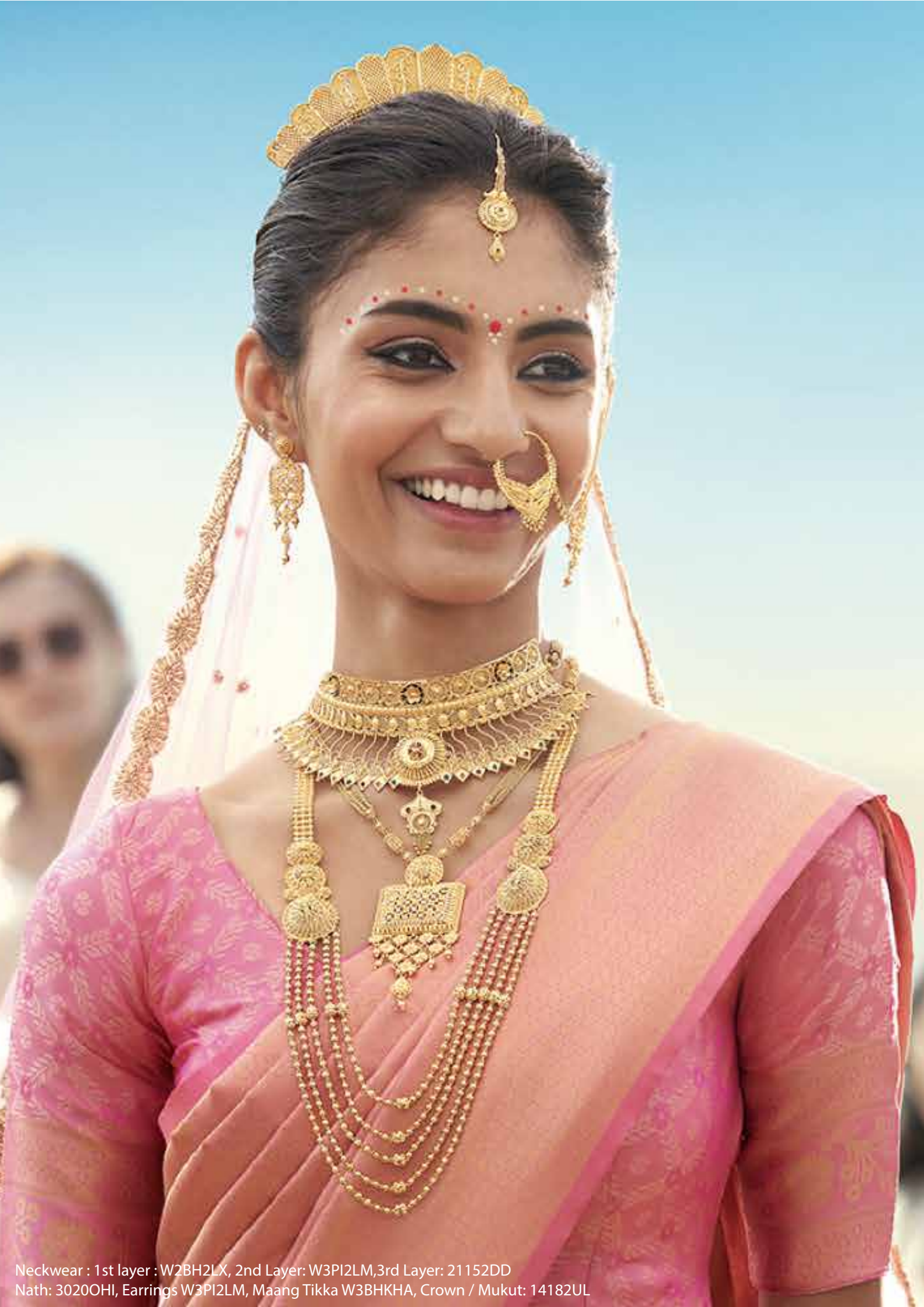
Neckwear : 1st layer : W2BH2LX, 2nd Layer: W3PI2LM,3rd Layer: 21152DD Nath: 3020OHI, Earrings W3PI2LM, Maang Tikka W3BHKHA, Crown / Mukut: 14182UL