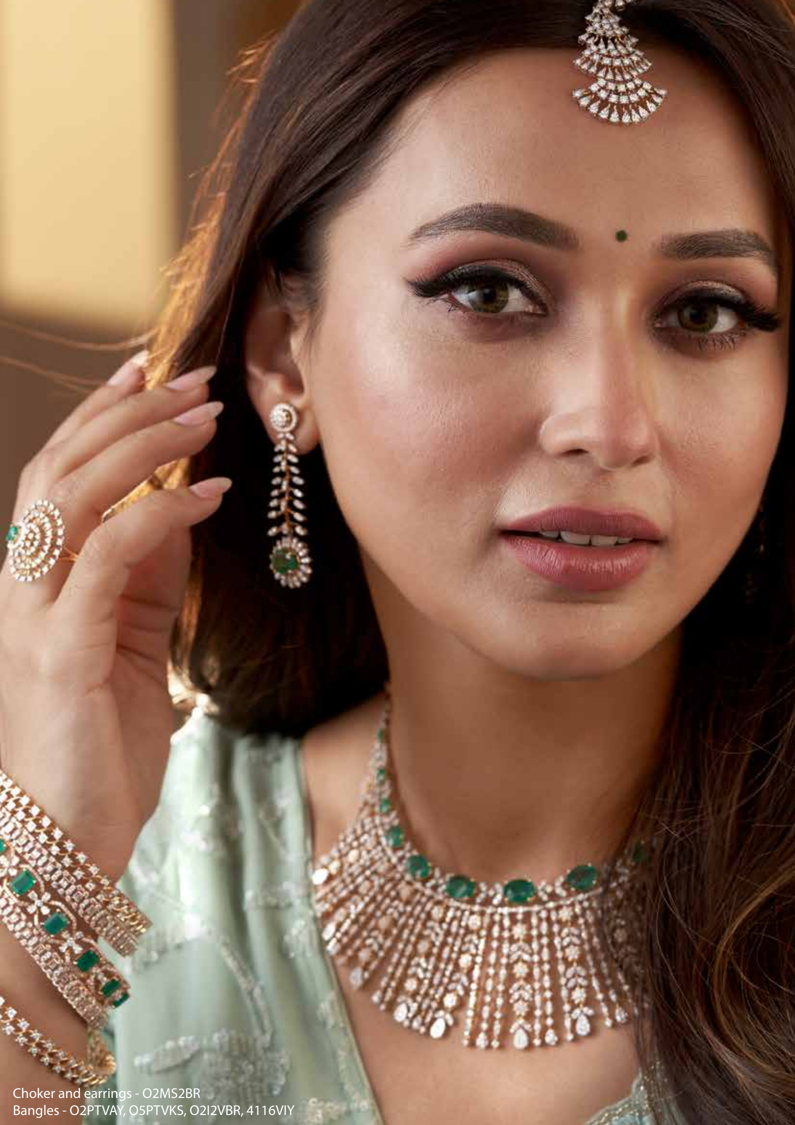
Choker and earrings - O2MS2BR Bangles - O2PTVAY, O5PTVKS, O2I2VBR, 4116VIY