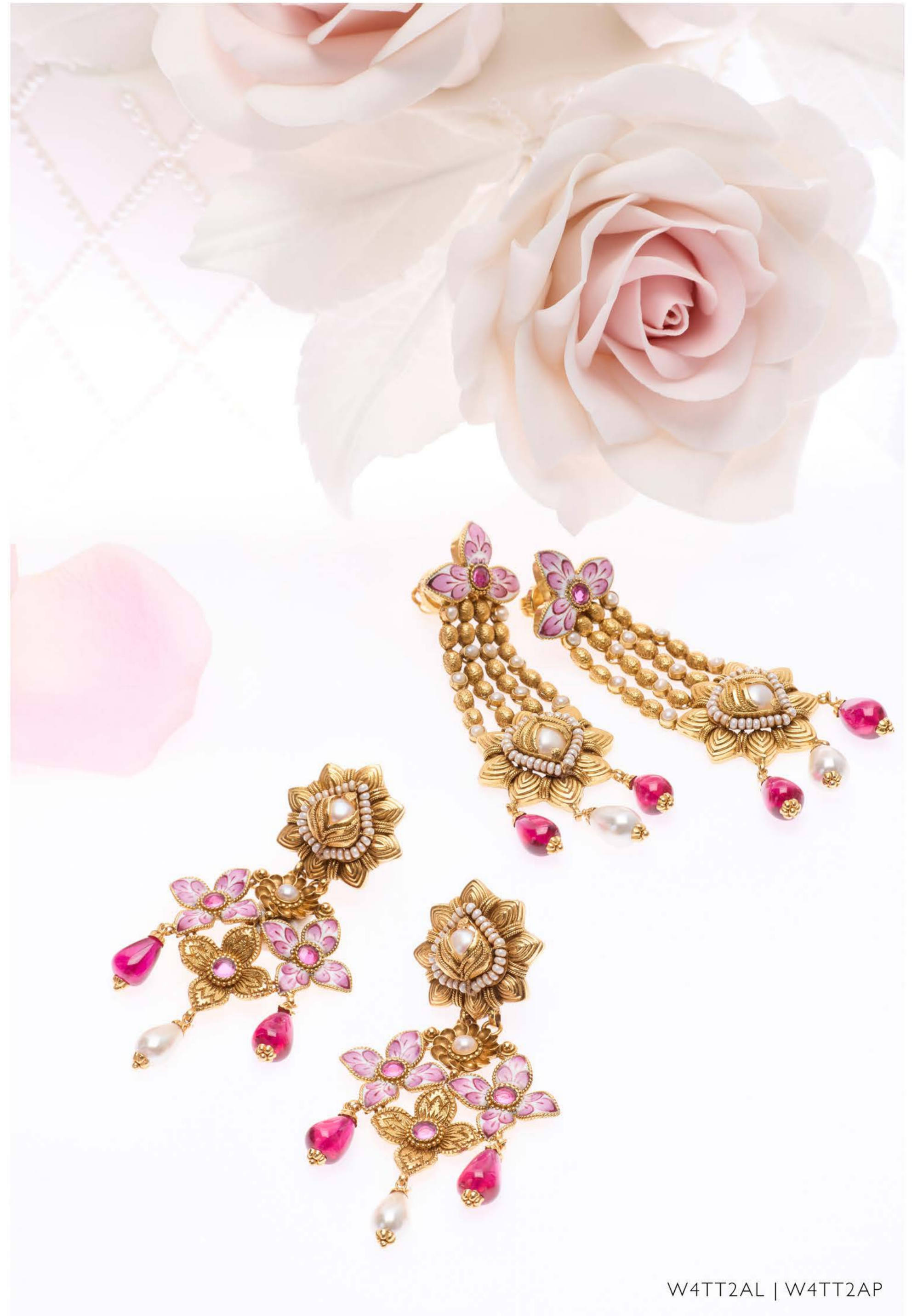
W4TT2AL | W4TT2AP

This trousseau elegantly showcases sophistication and craftsmanship, making it a bold choice for brides on their special day. Inspired by the phool chadar, it features a delicate bed of small gold and pink enamel flowers, culminating in a captivating half-opened bud with intricately layered gold petals and a lustrous pearl peeking through, symbolizing beauty and new beginnings.