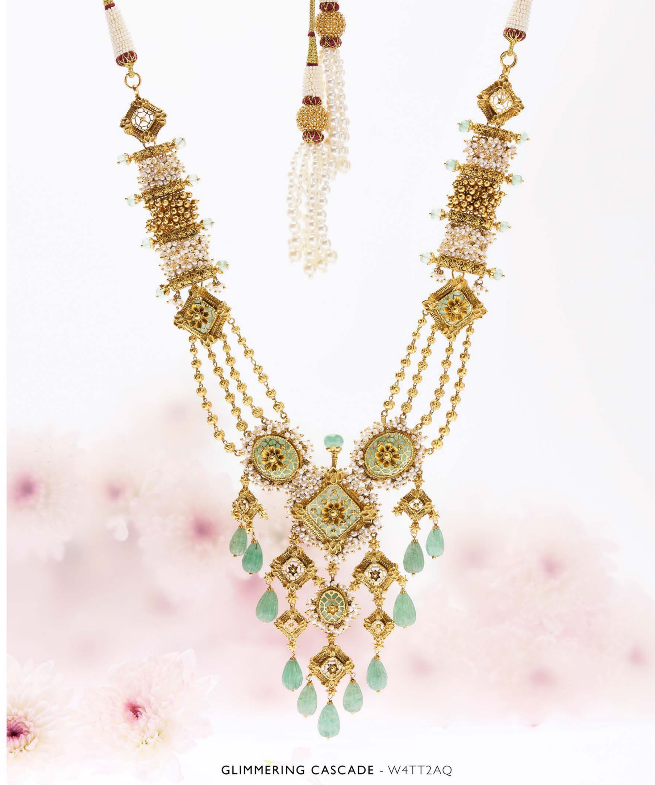
GLIMMERING CASCADE - W4TT2AQ

A breathtaking fusion of elegance and tradition, this long haaram adds a timeless touch to any bridal look. Inspired by the phool chadar, this exquisite piece features cascading 3D gold flowers artfully arranged against a laser-cut jali. The design's captivating interplay of light is beautifully complemented by vibrant green stones, creating a striking statement.