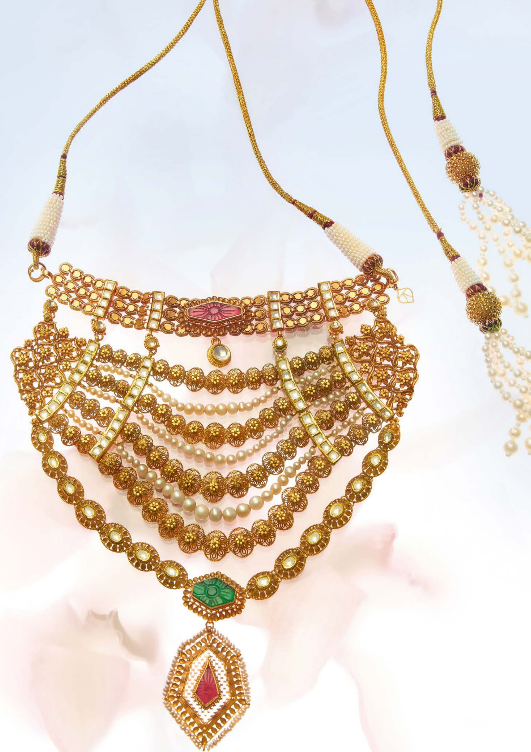
POETRY IN MOTION - W4TT2BA

This trousseau set combines heritage with modern elegance. Inspired by the draped layers of Tahiliani's lehengas, each side of the choker and every string in the haram reflects graceful layers. Featuring Chandak and wire detailing along with royal gold inlay work, this piece is crafted for the bride who cherishes tradition with a modern edge.