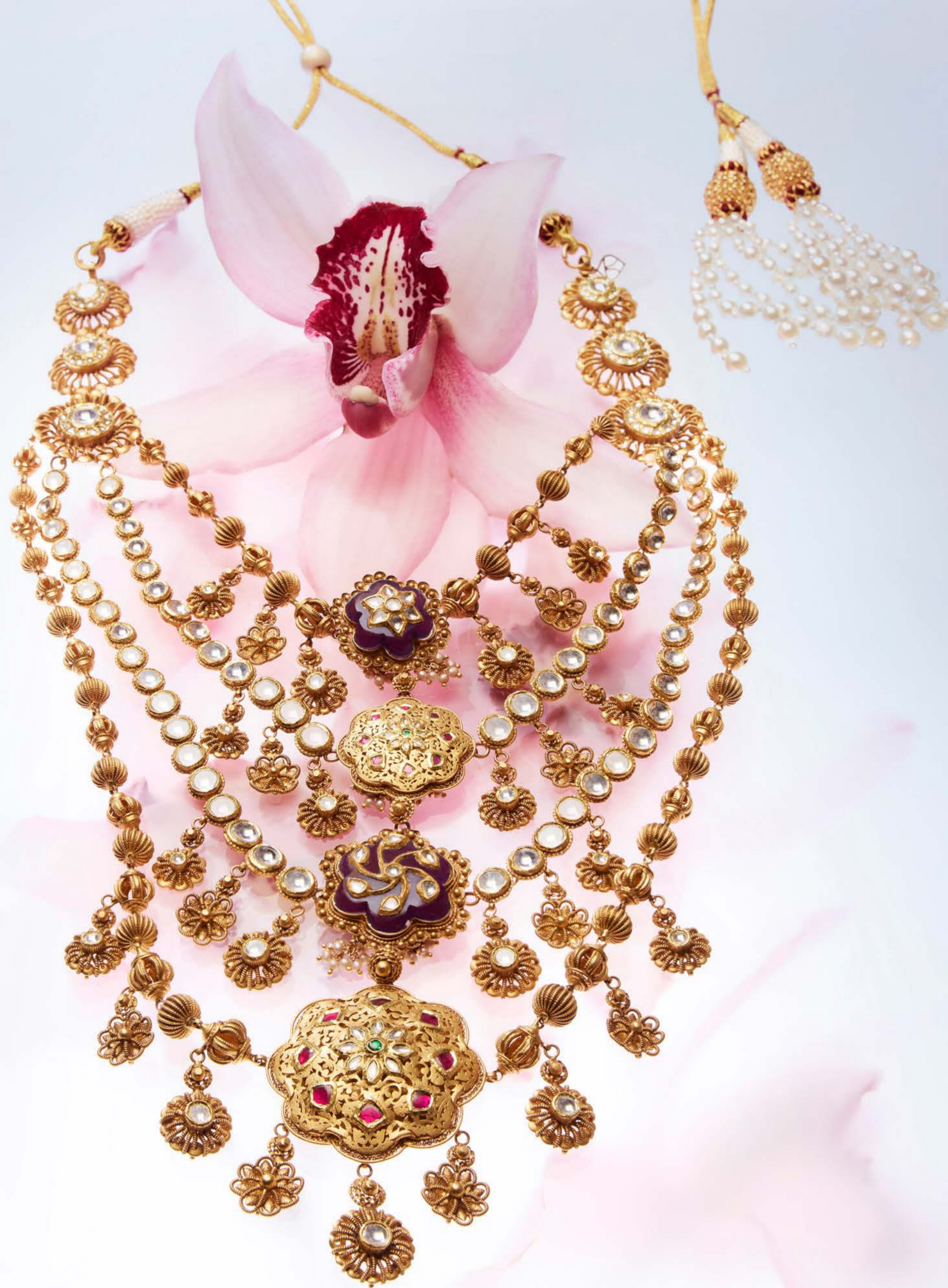
LAYERED GRACE - W4TT2BL

This trousseau set combines heritage with modern elegance. Inspired by the draped layers of Tahiliani's lehengas, each side of the choker and every string in the haram reflects graceful layers. Featuring Chandak and wire detailing along with royal gold inlay work, this piece is crafted for the bride who cherishes tradition with a modern edge.