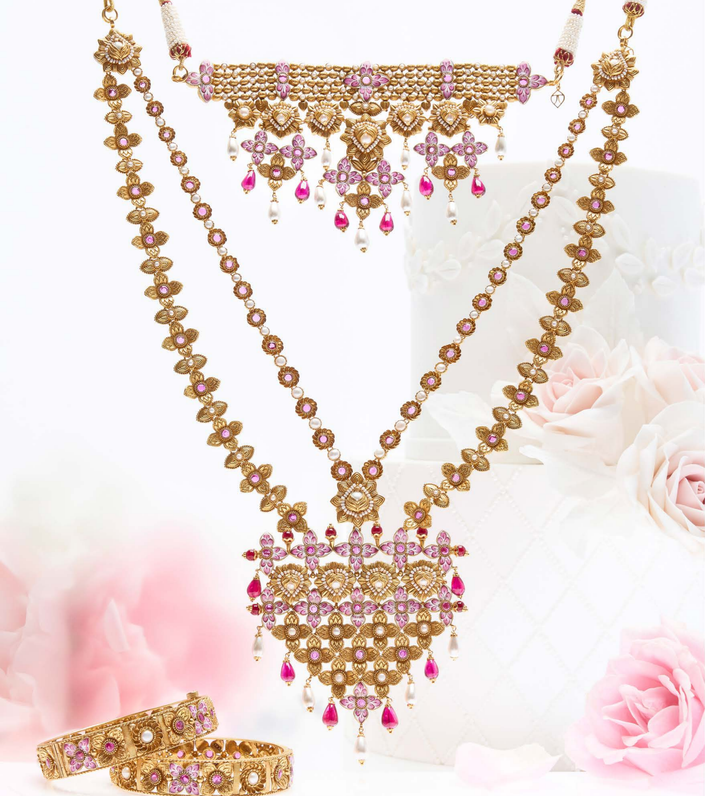
PETALS OF PROMISE - W4TT2AL | W4TT2AP

This trousseau elegantly showcases sophistication and craftsmanship, making it a bold choice for brides on their special day. Inspired by the phool chadar, it features a delicate bed of small gold and pink enamel flowers, culminating in a captivating half-opened bud with intricately layered gold petals and a lustrous pearl peeking through, symbolizing beauty and new beginnings.