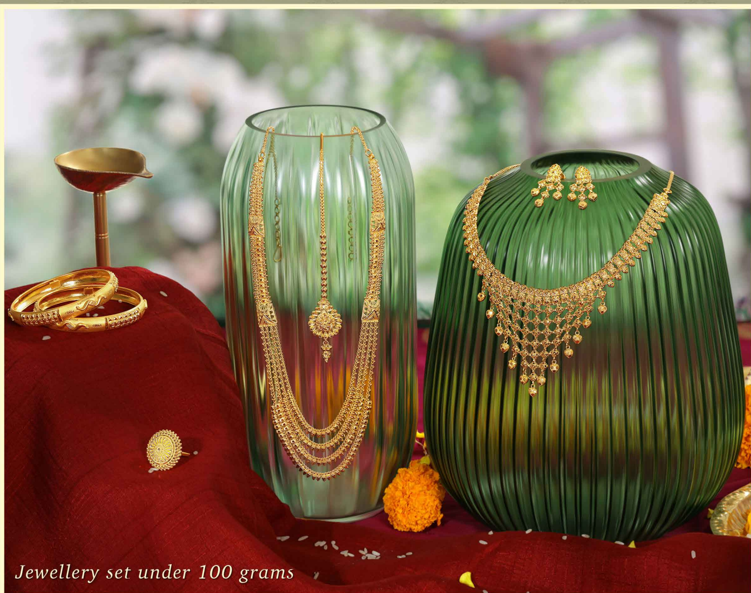
Jewellery set under 100 grams

Enhance the radiant charm and elegance of a Maharashtrian bride with these exquisite jewelry sets weighing less than 100 grams. The intricate gold craftsmanship and exceptional design make this set a perfect and cherished addition to your collection.