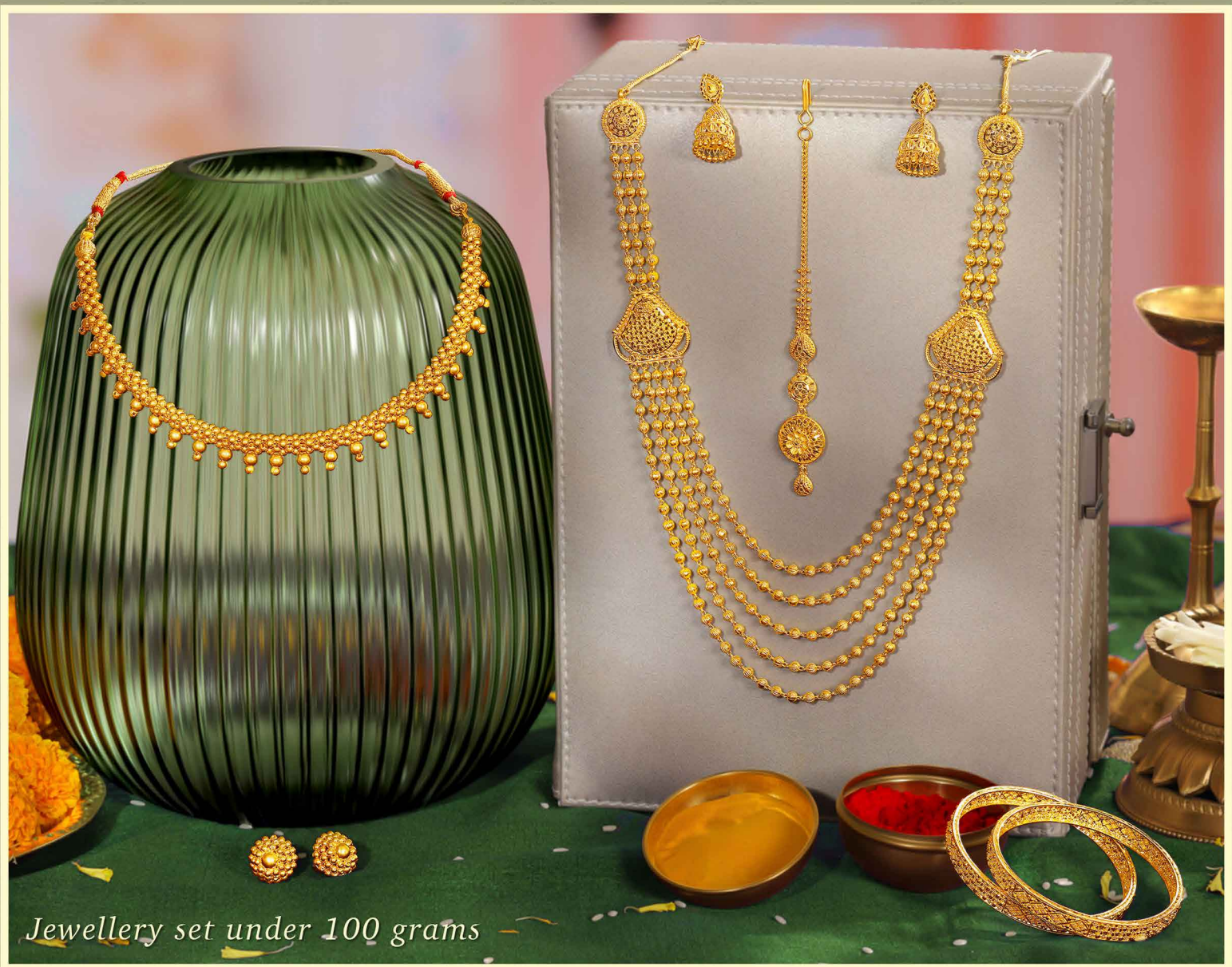
Jewellery set under 100 grams