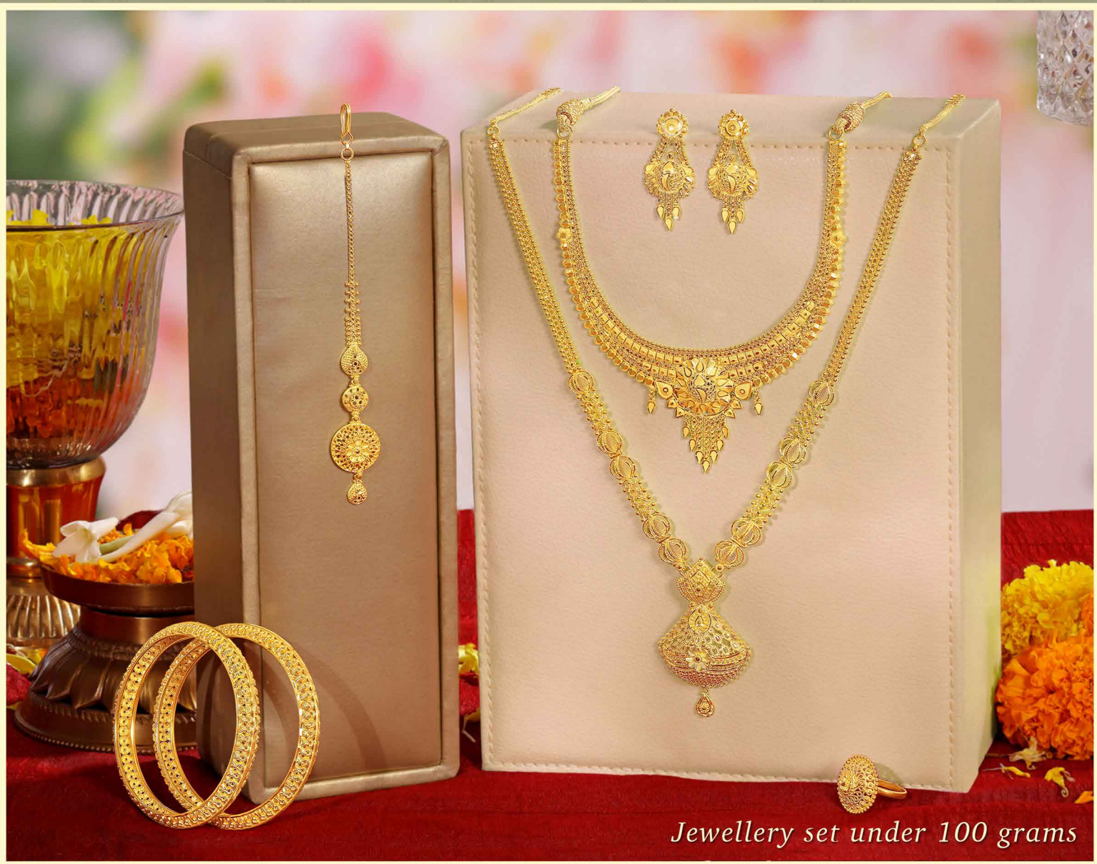
Jewellery set under 100 grams